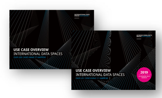
Use Case Brochures